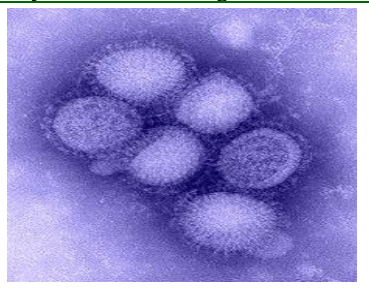
Fig. 1 Electron microscope image of the reassorted H1N1 influenza virus. The viruses are \sim 100 nanometers in diameter. [4]