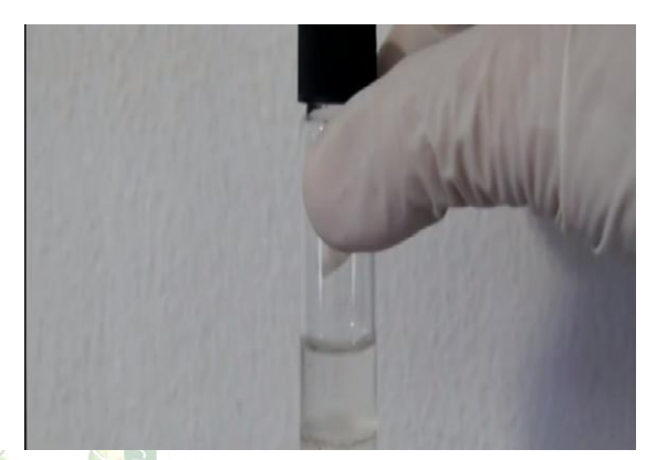
Fig 3:-Process of extraction of essential oil through Water and steam distillation technique