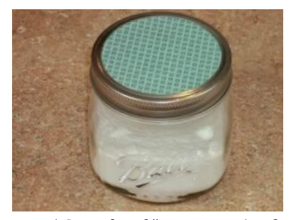
Fig:-5 Sample of "WIN FLU Air freshener gal"

Distilled water was added to sodium benzoate and stir. Heated at a temperature of 75°C and then lowered the temperature to 65°C. Gelatin and propylene glycol is added and stir until dissolved, remove the mixture from heat then added peppermint oil, herbal essential oil and citrus oil, stirring until homogeneous, inserted in the mold and allowed to stand at room temperature [10].Sample of air freshener gel can be seen in Fig 5.