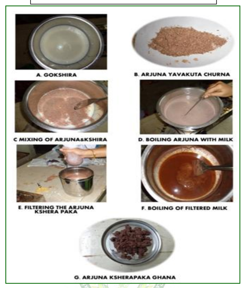
Fig.1 PREPARATION OF ARJUNA KSHEERAPAKA