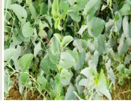
Fig: 3. Naaval Kottai Mathirai