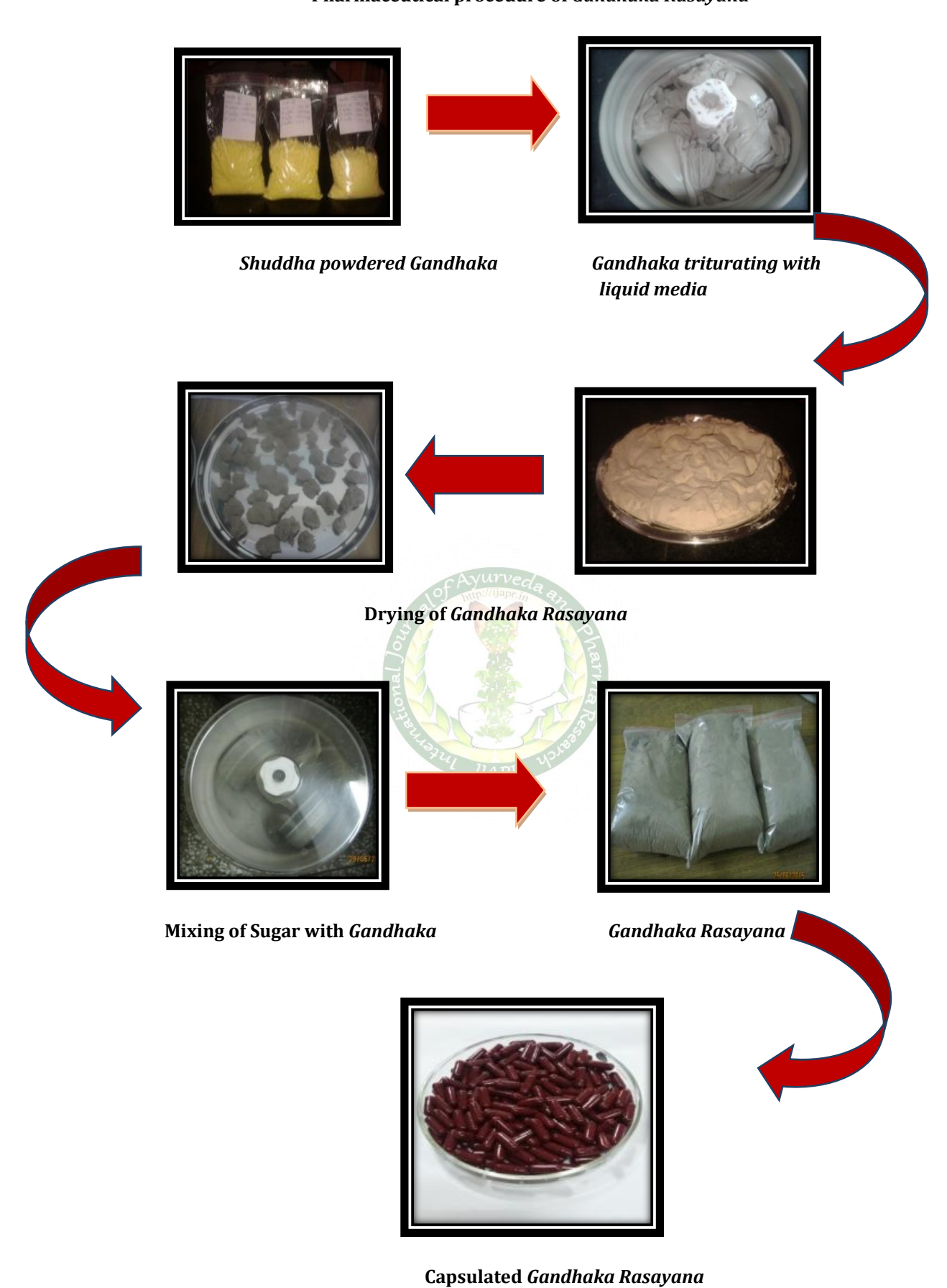
Available online at: http://ijapr.in