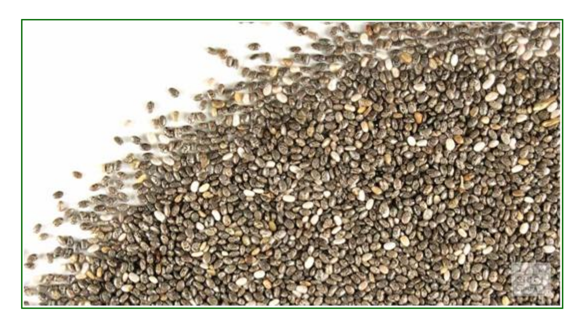
Figure 1: Chia Seeds