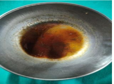
Fig. 2. Alcoholic extract of Guggulu