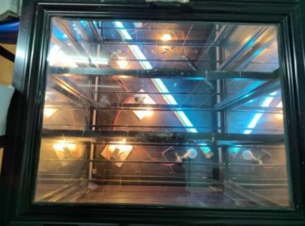
Fig. 4. UV cabinet with Ksharasutra