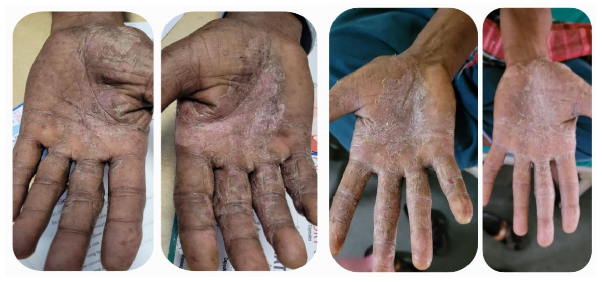
Fig 1. Before treatment