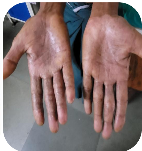
Fig 3. After Virechana