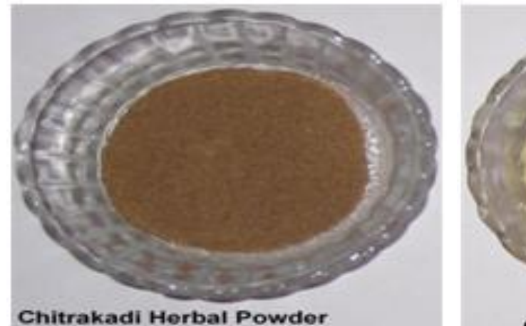
Figure 1: Chitrakadi Herbal Powder