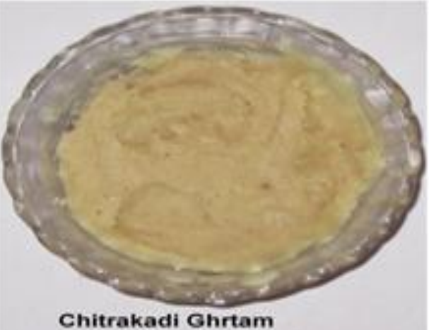
Figure 2: Chitrakadi Ghrita