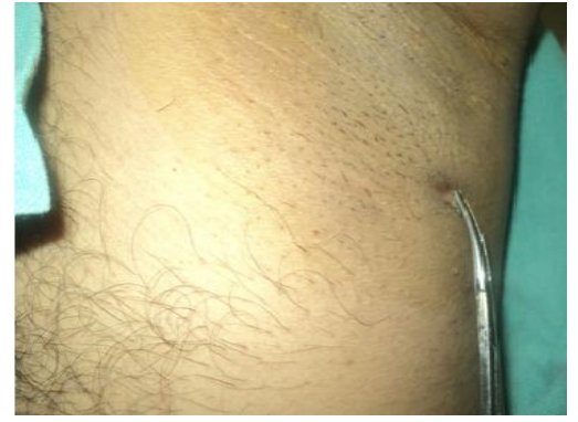
Figure 4: Holding of wart in artery forceps