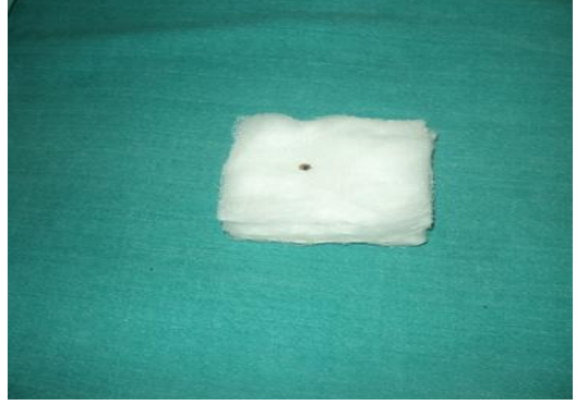
Figure 7: Removed wart