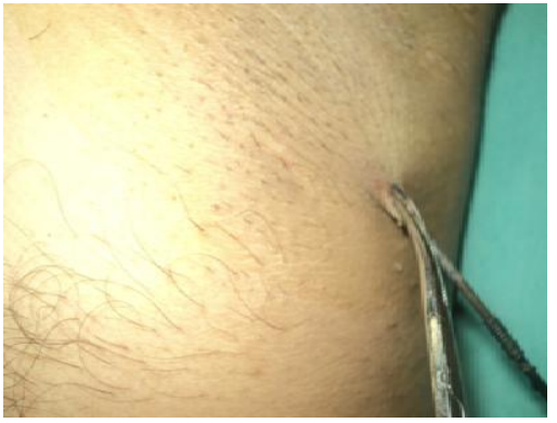
Figure 6: Application of probe at base of wart