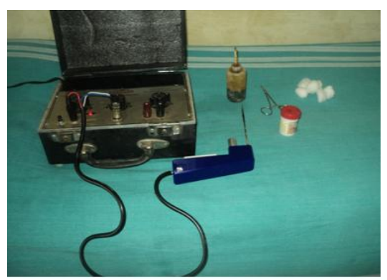
Figure 1: Instruments for Agnikarma