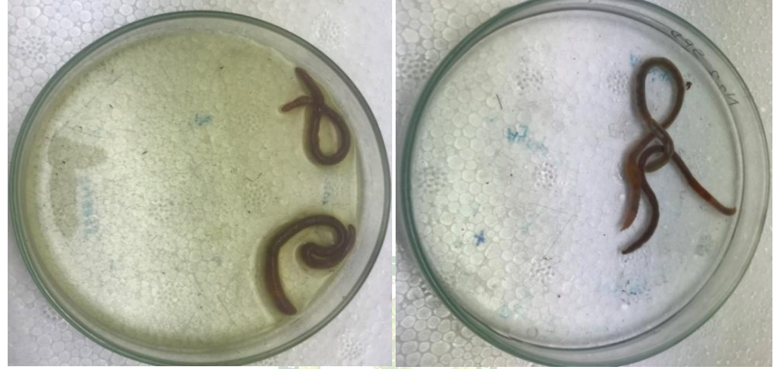
Figure 2 A) Standard drug

The figures for the death of the worms in corresponding concentrations were given (see figure; 1, 2, 3, 4, 5)