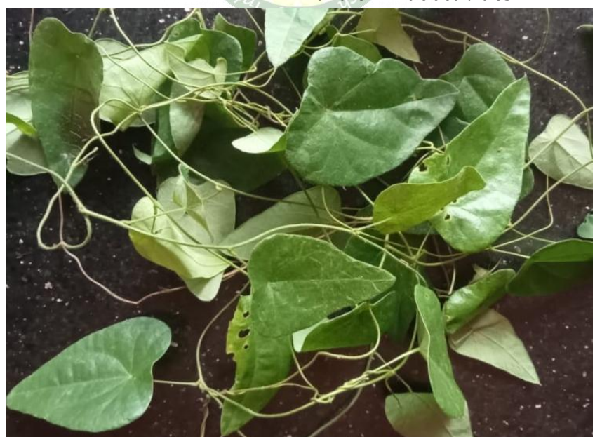
Figure 1: Leaves of Cyclea peltata

Medicinal plants produce some chemical constituents which possess numerous biological activities and help the plants to resist pests and diseases (Vaarst et al., 1996). Some previous studies showed that chemical constituents like alkaloids, tannins, flavonoids, phenols, etc possess appreciable anthelmintic activities. <sup>[23,24]</sup>