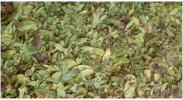
Plate 1- Fig 1: Rasna leaves