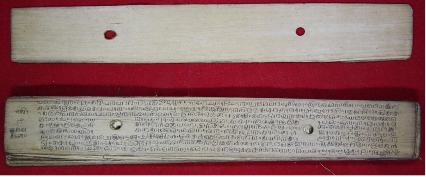
Figure 2: Kairava grama. Example of a Taalipatragrandha (palm leaf manuscript)

In the recent years many researchers have taken up the critical edition of Ayurveda manuscripts. For example.