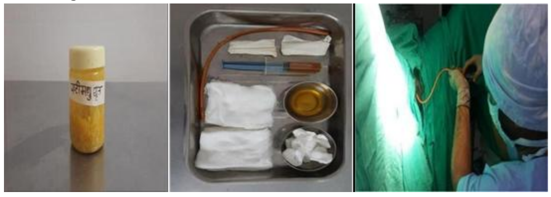
Pics no 1, 2, 3 revealing Yashtimadhu Ghrita prepared, dressing tray (instruments and procurements) and procedure of Gudapurana respectively.