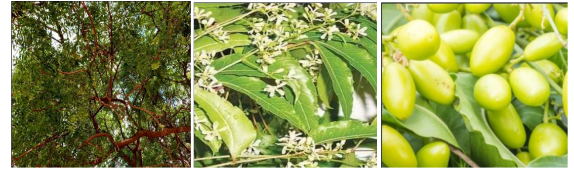
Available online at: <u>http://ijapr.in</u>