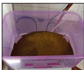
Pathyashadangam kashaya ghanasatwa