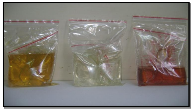
Tila Tail Glycerine Lysol