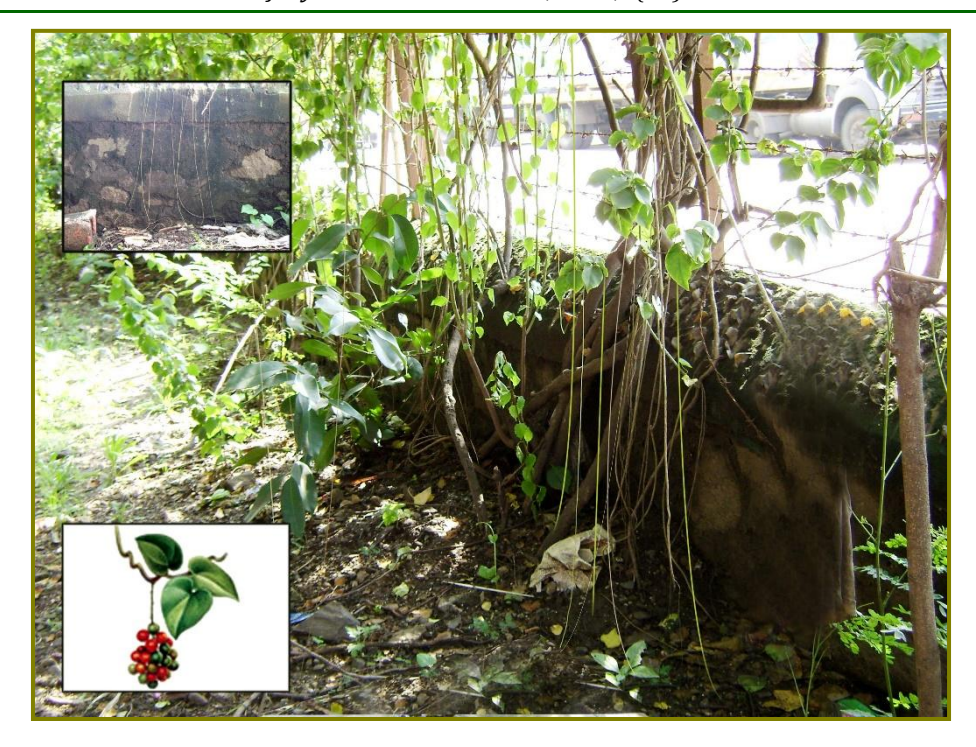
Figure 1: Place of Collection of tendrils of Tinospora Cordifolia :