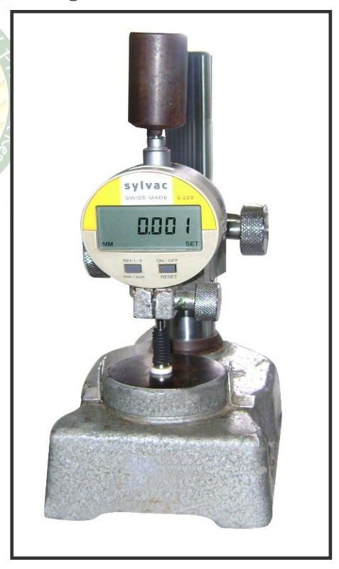
Figure 3: Diameter Testing: