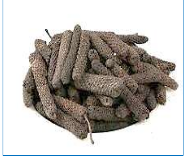
Fig.No. 2 Badi Pippali

Source of support: Nil, Conflict of interest: None Declared