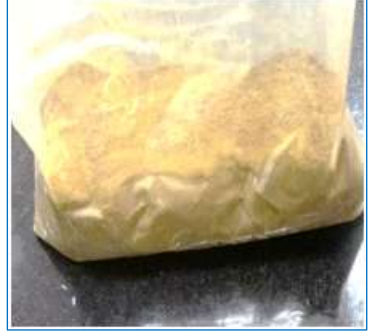
Fig.No.3 Pippali Fine Powder