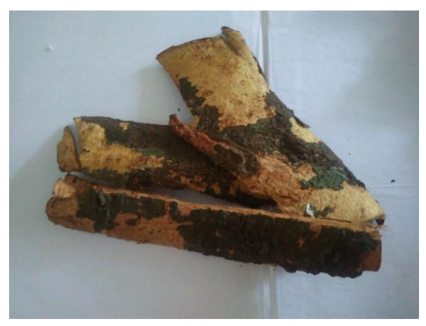
Figure 1: Sample of Humboldtia vahliana

values for all groups were calculated and tabulated. (Table no2) The significance of the data across all groups was analyzed by Kruskal-wallis test which is the non-parametric version of ANOVA. The p value corresponding to the Kruskal Wallis test is lower than 0.05, suggesting that one or more treatments are significantly different. Mann- Whitney U test follows.