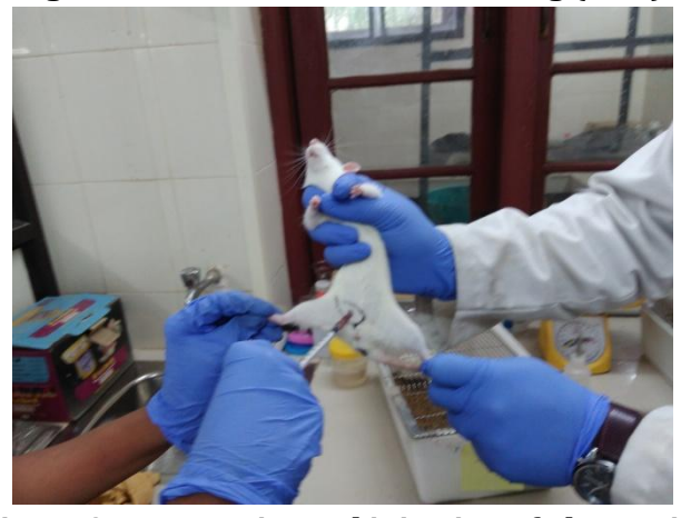
Figure 3: Intraperitoneal injection of phenytoin