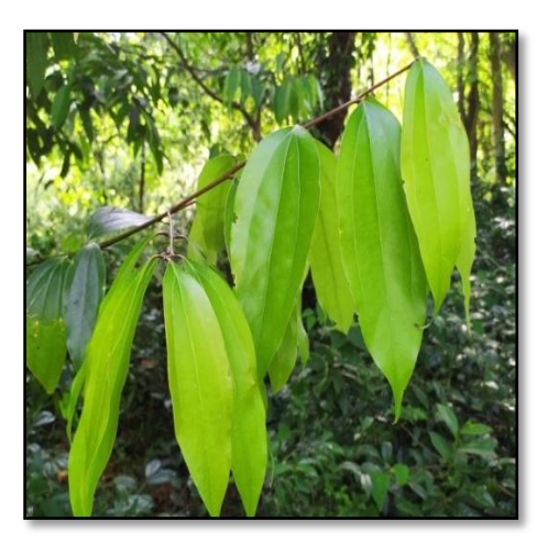
Tejpatta ( Cinnamomum tamala (Buch.-Ham.) T.Nees & Eberm.)