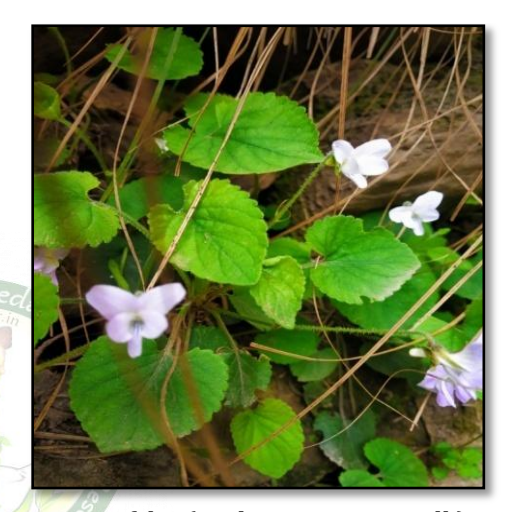
Banafsha (Viola canescens Wall.)