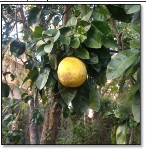
Chakotra (Citrus maxima (Burm.) Osbeck.