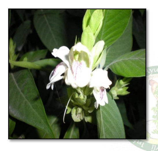
Basuti (Justicia adhatoda L.)