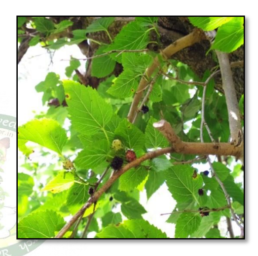
Cheemu (Morus alba L.)