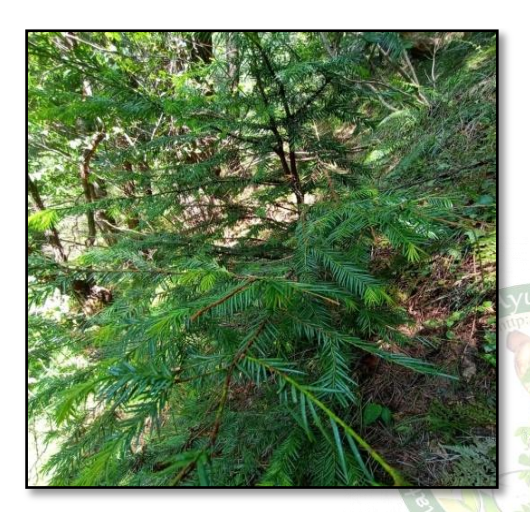
Rakhal (Taxus wallichiana Zucc.)