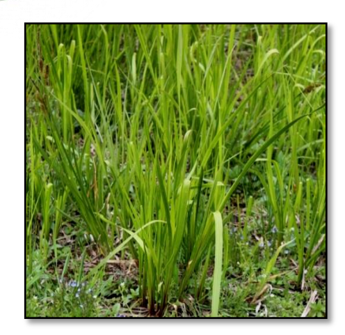
Bare (Acorus calamus L.)