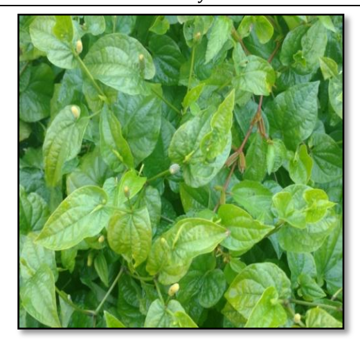
Magha Pipli (Piper longum Linn.)