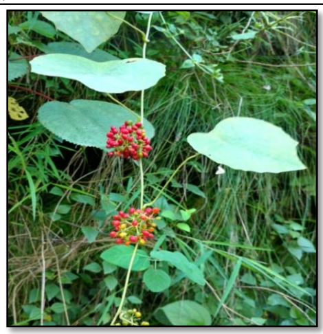
Giloye (Tinospora sinensis (Lour.) Morr.)