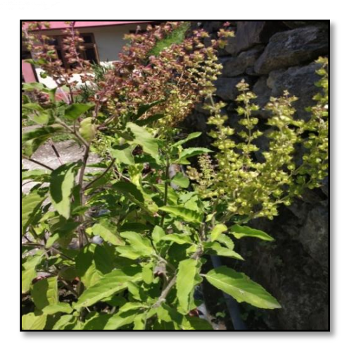
Tulsi (Ocimum sanctum L.)