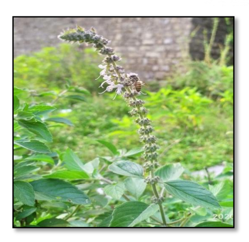
Karpur Tulsi ( Ocimum kilimandscarium Gurke.)