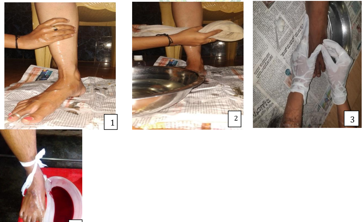
Fig.No:2 Procedure of Siravyadhana

1- Jalouka in fresh water 2- Jalouka in Haridra Jala 3- Covered the body of Jalouka with Pichu 4-horse-shoe shape neck of Jalouka showing proper sucking 5,6- Chardana of Jalouka