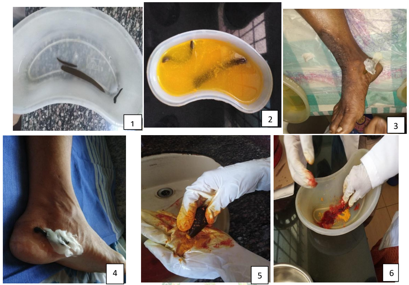
Fig No:1 Procedure of Jaloukavacharana

1- Jalouka in fresh water 2- Jalouka in Haridra Jala 3- Covered the body of Jalouka with Pichu 4-horse-shoe shape neck of Jalouka showing proper sucking 5,6- Chardana of Jalouka