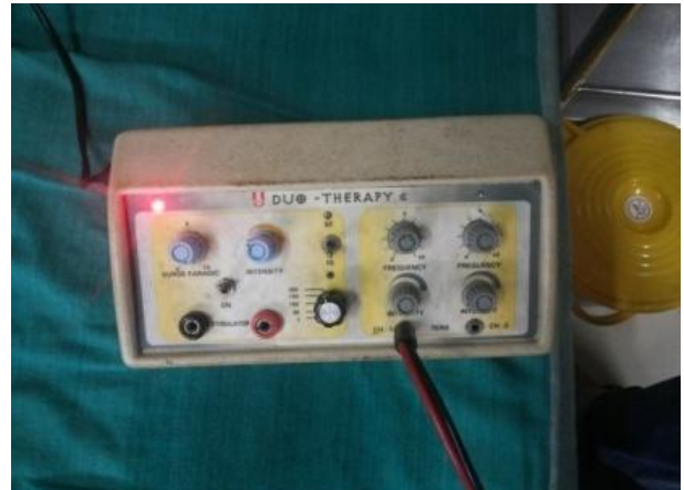
Fig. (A) & (B) Showing T.E.N.S. Therapy