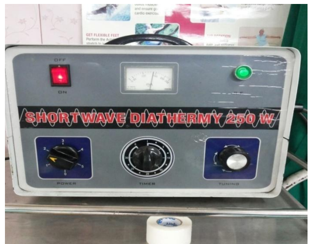
Fig. (E) & (F) Showing Short wave diathermy therapy