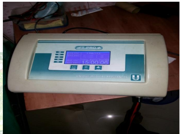
Fig. (C) & (D) Showing Interferential Therapy