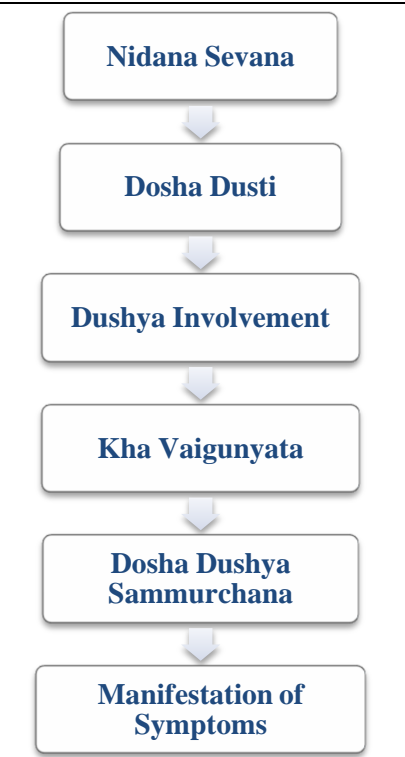
Flowchart 1, Stages of Disease manifestation