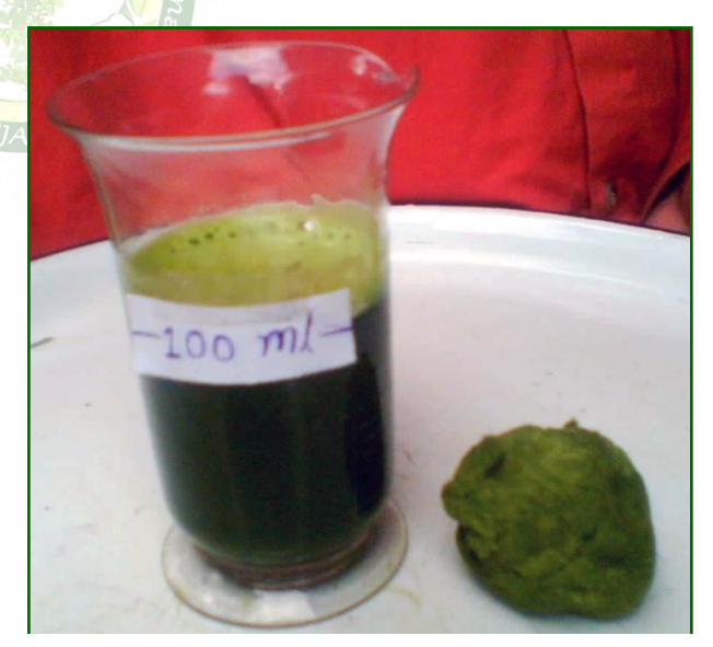
Wheatgrass paste & its Juice