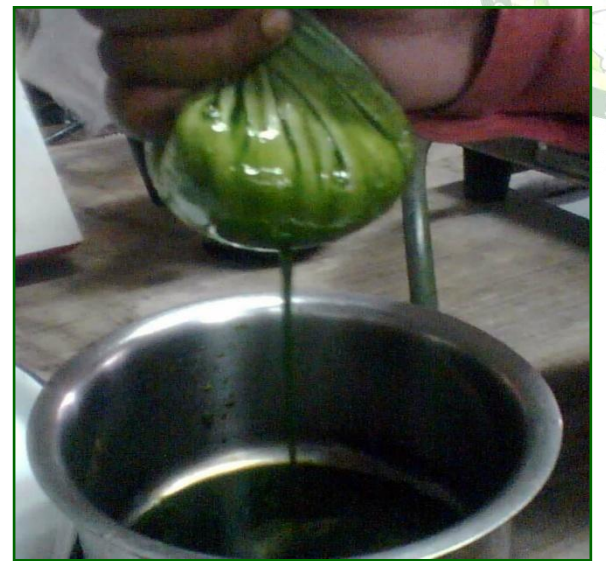
Extraction of wheatgrass juice