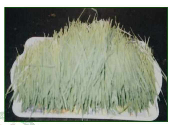
Wheatgrass taken for paste