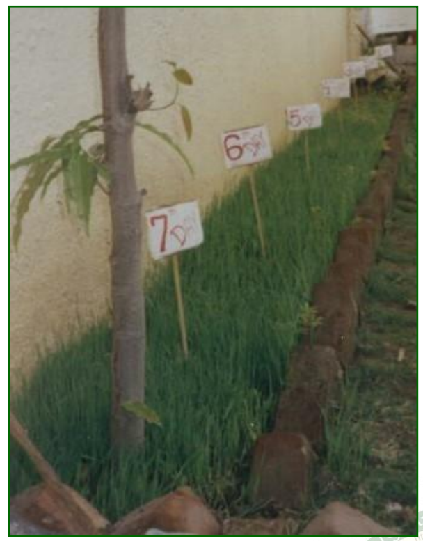
Wheatgrass cultivation with day wise labeling