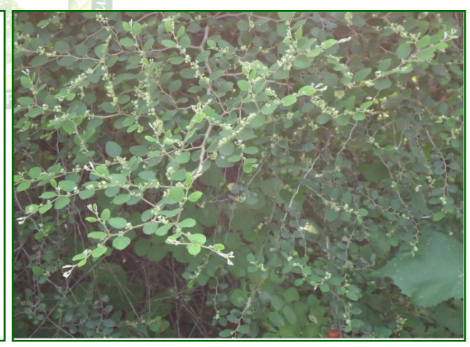
Plate 1: Ziziphus Mauritiana - Habit