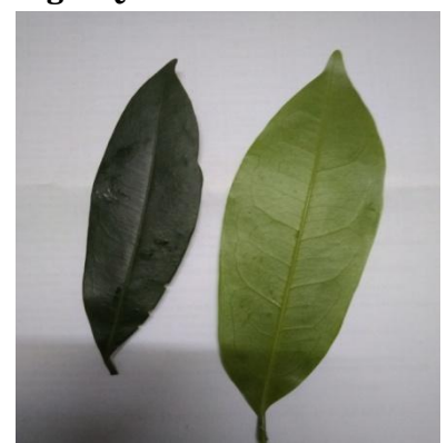
Fig 2: Leaves of Quassia indica Gaertn