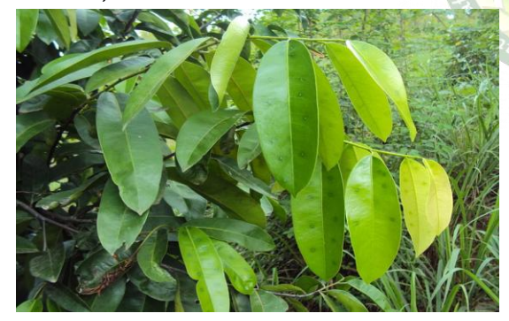
Fig 1: Quassia indica Gaertn

The fresh leaves of Guchakaranja (Quassia indica Gaertn) were collected from the Puthiyakavu locality of Tripunithura. The sample was identified as genuine by the Pharmacognostic studies, conducted department of Dravyaguna Vijnanam, Government Ayurveda College, Tripunithura, Kerala. The leaves were washed with water thoroughly to remove physical impurities like soil, mud etc., and then chopped and dried well in sun. It was then powdered and kept in airtight containers. The Phytochemical analysis was done standardization unit of Department of Dravvaguna Government Vijnanam, Ayurveda College. Tripunithura, Kerala.