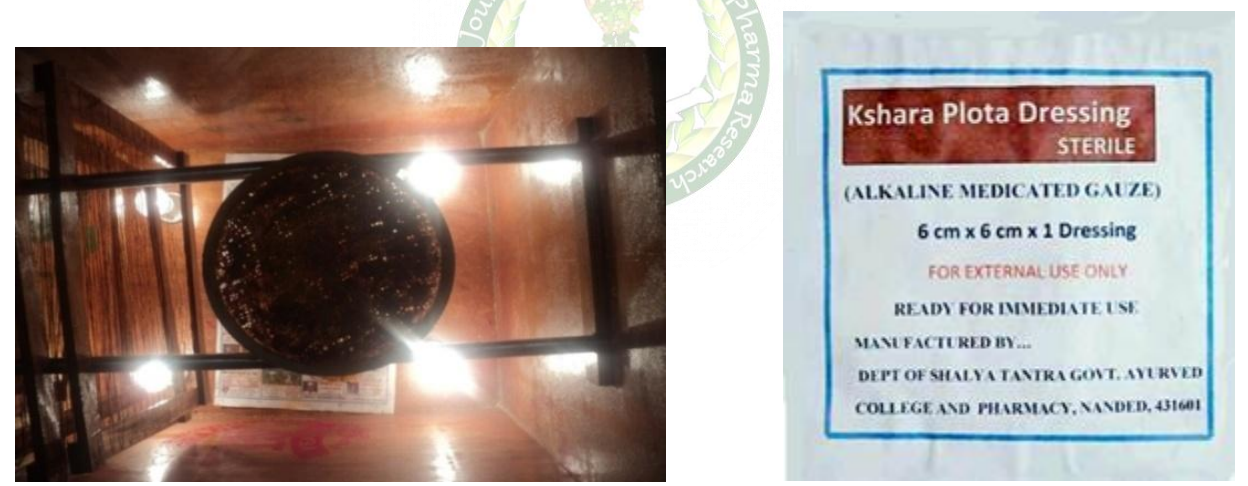
Figure 15. Sterilization of Prepared Ksharaplota in Cabinet Figure