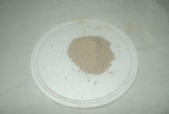
Figure 2. Apamargakshara