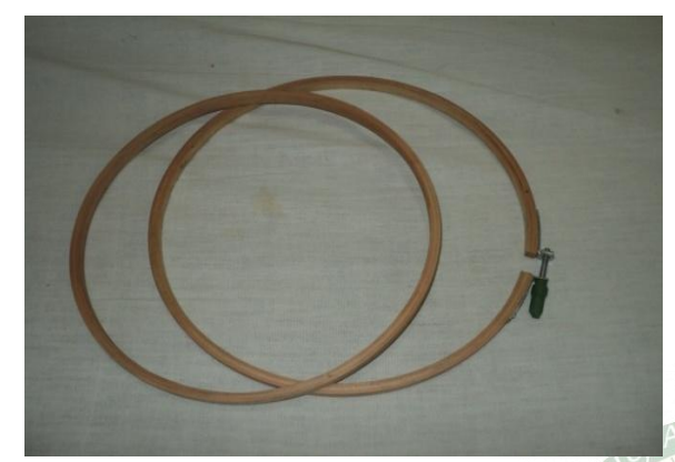
Figure 5. Open Circular Ring Figure