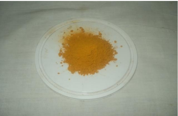
Figure 3. Haridra