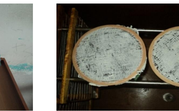
Figure 10. Drying of Plota in Cabinet Snuhikishira