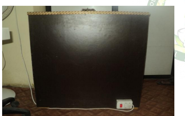
Figure 7. Cabinet