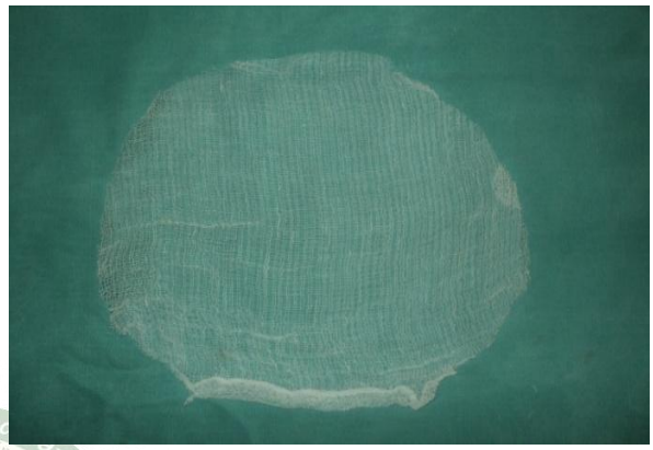
Figure 6. Plota ( Gauze)