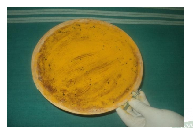
Figure 13. 1<sup>st</sup> Complete Coating of Haridra