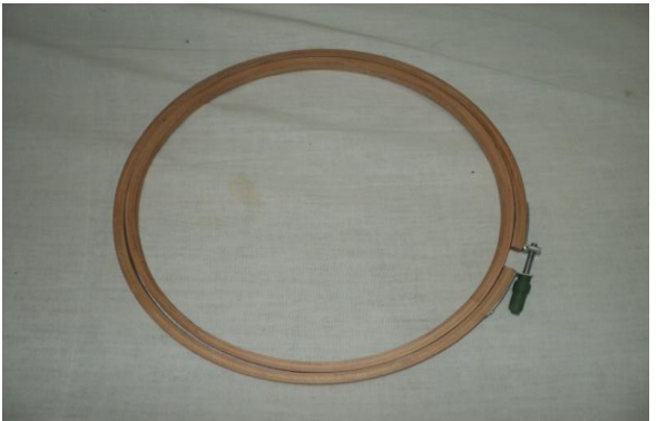
Figure 4. Circular Ring