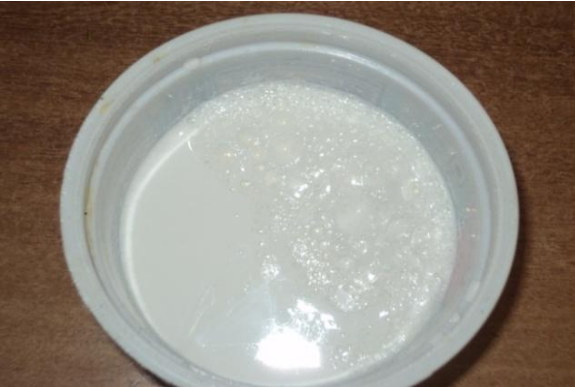
Figure 1. Snuhikshira