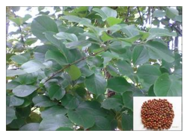
Figure 1: Jyotishmati Plant with seeds

Jyotishmati acts as Medha Stimulator or Intelligence enhancer.